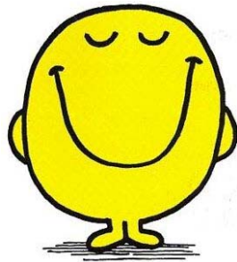
Answer: Mr Happy