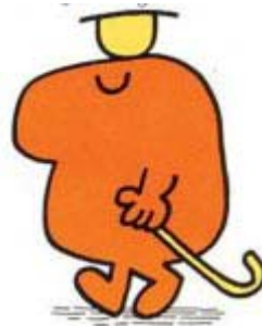
Answer: Mr Topsy-Turvy