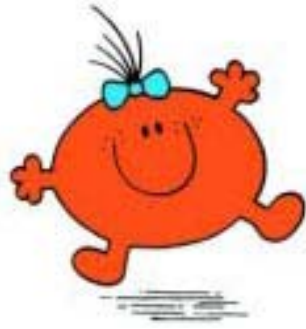
Answer: Miss Fun