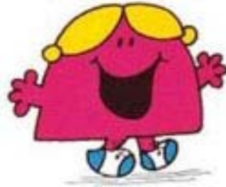
Answer: Miss Chatterbox